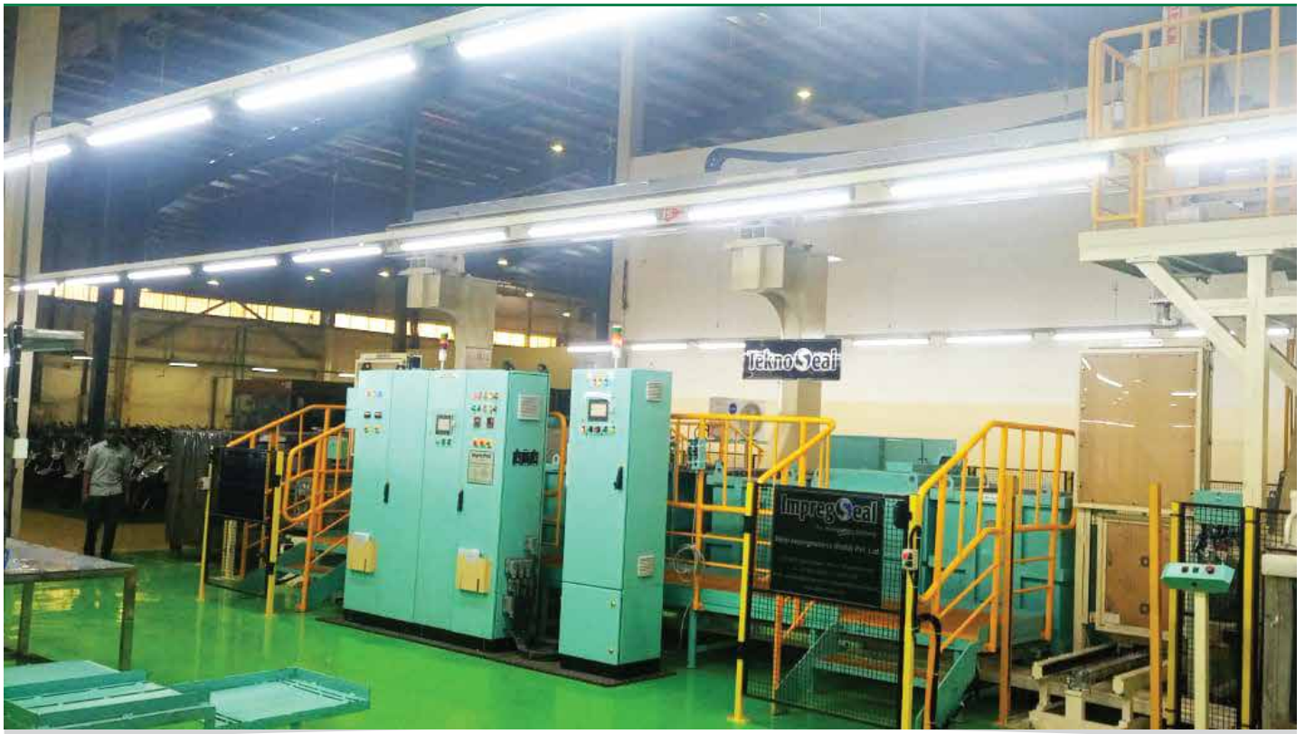
Fully Automatic Installation supplied to global two wheelers manufacturer